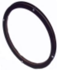
FRONT RING ASSY 3212-1SP $125.00